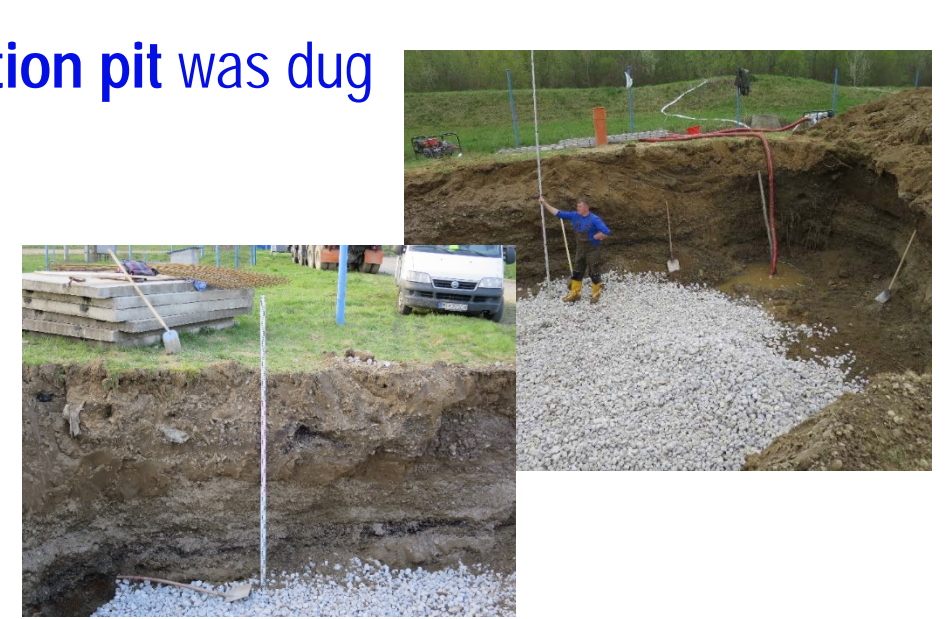
... for placing the lysimetric containers into which were installed soil monoliths with sensors.