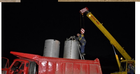
The beginning in March, 2014.

Immediately after collection of five different soil monoliths, the undisturbed soil samples were taken (5 x 50 samples) to Kopecky's cylinder (to determine pF curves and other hydrophysical characteristics) in the horizontal as well as vertical direction of 10 cm to a depth of 2.5 m. Disturbed soil samples (5 x 25 samples) were also taken for soil texture analysis by the same direction of 10 cm to a depth of 2.5 m. Altogether, 375 soil samples were processed.